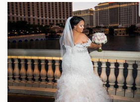
Wedding P/A Systems

GOLD PACKAGE: $950.00 This package is suitable for indoor or outdoor events. It includes: DJ / MC, Sound & T-Bar Par Lighting. Event Set-Up, 4 Hours to entertain your guests and Equipment Teardown. Additional Hours will be billed at $100.00 Per Hour.